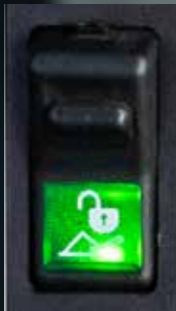
Safety Switch (loader)

Disables the control lever of loader, backhoe (excavator), and stabilizer levers by flipping the safety switch on the side console