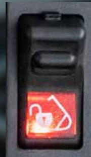
Safety Switch (backhoe)